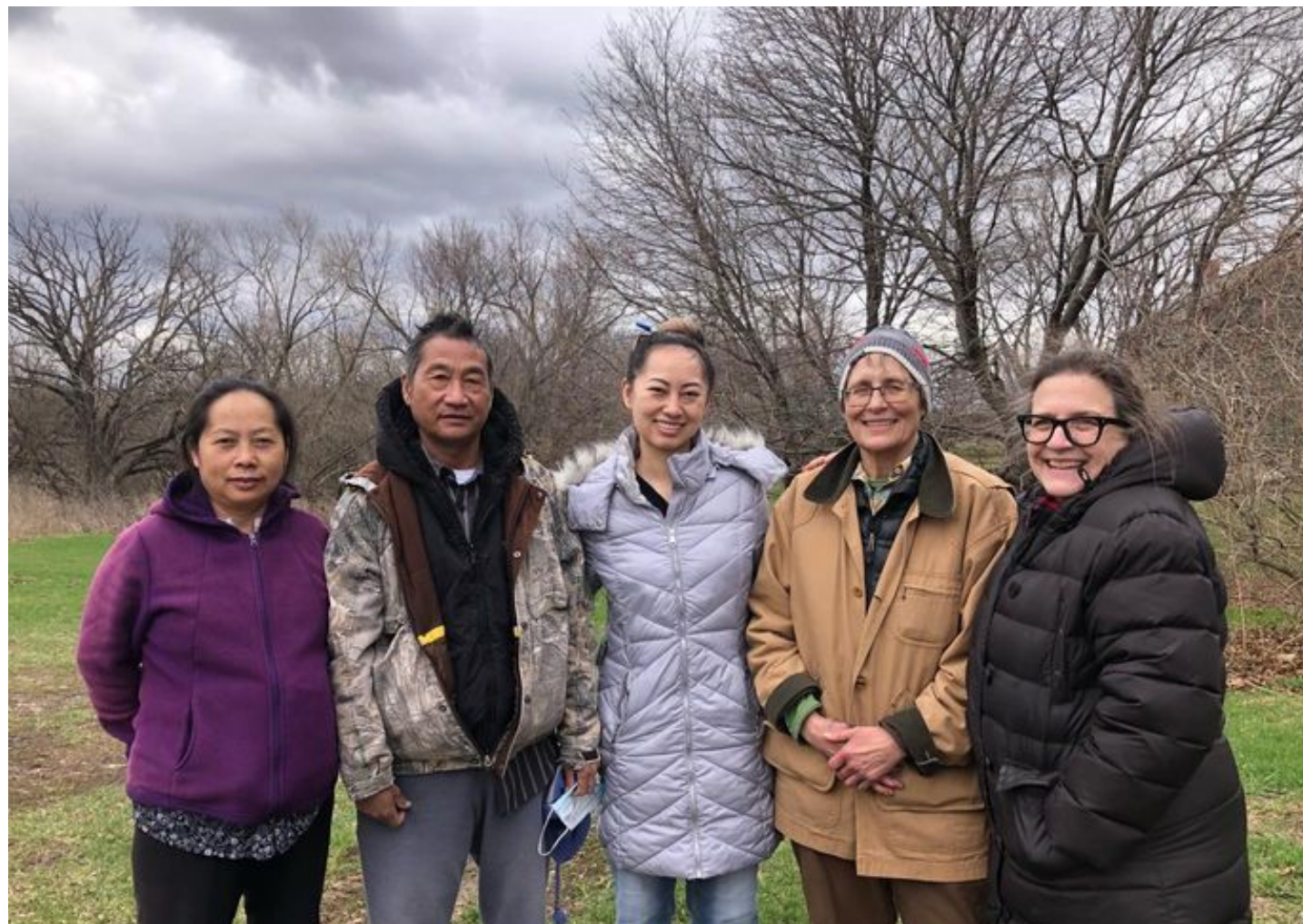
Singing Hills Farm